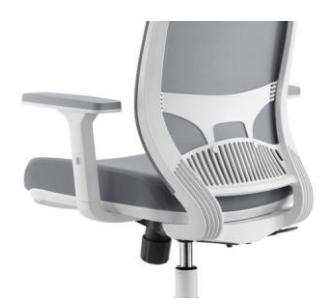
Synchro Mechanism With 3 Position Lock