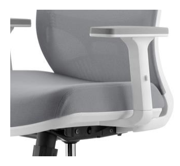
Pivotable Arm Pads