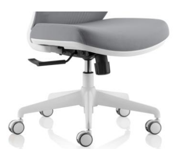
Height Adjustable Arms